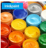
Ink & paint