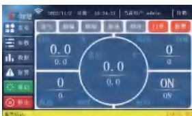
LCD Touch screen