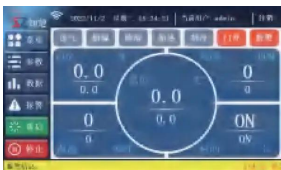
LCD Touch screen