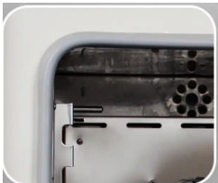
Qualified silicone sealing ring