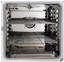
Stainless steel liner