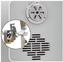
Vent hole and cooling motor