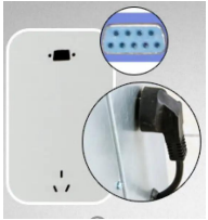
Microcomputer interface and plug solid frame