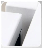
Qualified cold rolled steel sheet