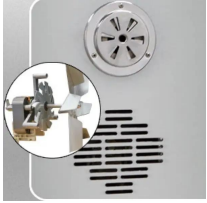
Vent hole and cooling motor