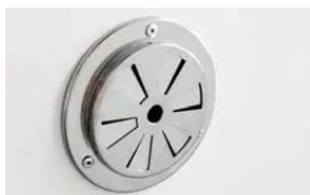
Pressure balance hole