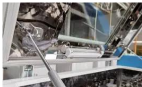
Pneumatic gas spring holder