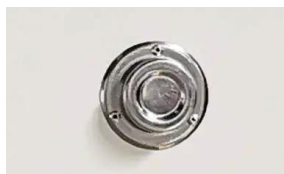
25mm test hole