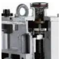
Auto antisuck back valve