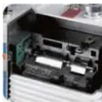
Integrated pump body structure