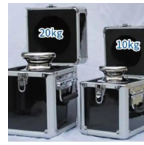
20kg 20kg 1