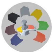
Color-Code Easy selection of the correct micropipette