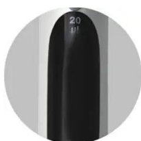
4-position volume display