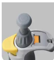
Easy calibration institutions