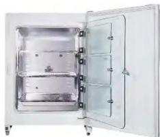
with 3 inner glass doors (standard)

Three inner glass doors maintains stable climatic conditions, minimizes any changes to the humidity, heat and gas concentration, shortens recovery times significantly and also further reduces the risk of contamination.