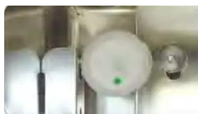
CO 2 Inlet filter

All gas injection lines are filtered via HEPA filter to remove impurities and contaminants before being injected into the chamber. The HEPA filter is able to filter particles larger than 0.3µm at 99.998%.