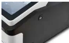
USB flash disk or printer can be connected