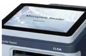
10 inch high-resolution LCD touch screen

Built-in incubation function, the incubation temperature range is room temperature +4 °C ~ 65 °C.