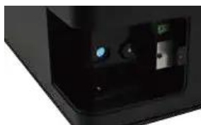
8-bit filter wheel