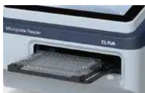
With vibrating plate function