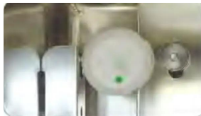
CO 2 Inlet filter

All gas injection lines are filtered via HEPA filter to remove impurities and contaminants before being injected into the chamber. The HEPA filter is able to filter particles larger than 0.3µm at 99.998%.