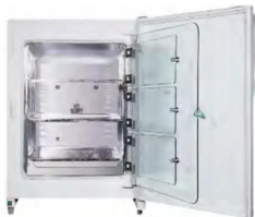
with 3 inner glass doors (standard)

Three inner glass doors maintains stable climatic conditions, minimizes any changes to the humidity, heat and gas concentration, shortens recovery times significantly and also further reduces the risk of contamination.